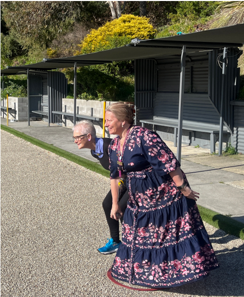
Family Fun Night